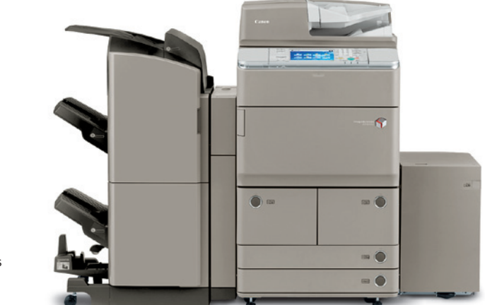
imageRUNNER® ADVANCE 6075

Outstanding image quality, streamlined workflow, enhanced usability, and versatility for light production environments. A new platform allows you to achieve higher quality output at top speeds.